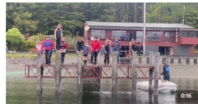
Even if there is no wind to sail there is fun to be had jumping off what is probably the most famous Jetty in New Zealand!