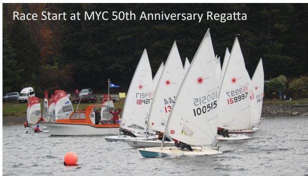
Race Start at MYC 50th Anniversary Regatta

There are plenty of opportunities to learn about yacht racing and gain the skills required to become a competent crew member on one of the privately owned trailer yachts within the club. Entering the sport this way allows you all the fun of sailing on the larger boats without the expense of buying one.