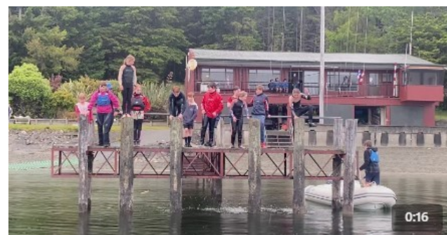
Even if there is no wind to sail there is fun to be had jumping off what is probably the most famous Jetty in New Zealand! (Find the Video on our FB page)